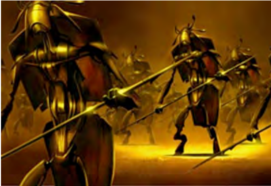
The Card Soldiers prepare for battle. Click for larger image.