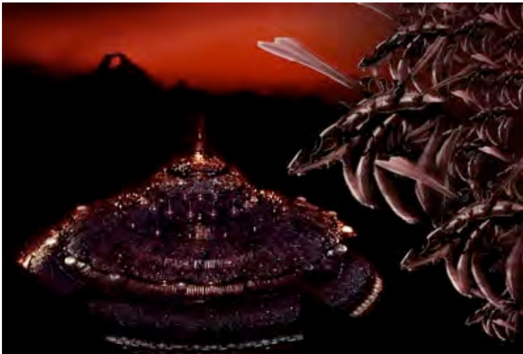
---Automatic Pictures. Artist: Doug Chiang Redd's Fortress as seen from above. Click for larger image.